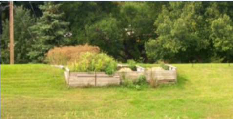
UNACCEPTABLE encroachment. Gardens and compost bins located on levee crest and riverward slope.