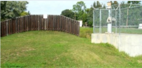
UNACCEPTABLE encroachment. Residential and rural fences crossing the