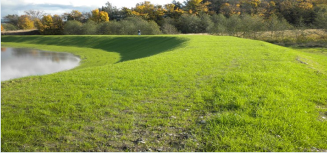
ACCEPTABLE. Landowner has not encroached on the levee crown or the 15-foot clear zone.

A 15-foot minimum clear zone on the landward side of the levee is required to allow for inspection and emergency measures. Excavations, structures, or other obstructions present within the levee clear zone are generally prohibited. Fencing that prohibits access along the levee crown is prohibited.