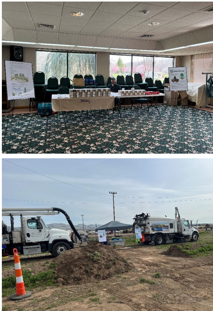
Figure 3. 2023 Arbor Day & Dozer Days Event's

Yakima County along with other members of the RSWG and the City of Yakima provided a Stormwater Public Education and Outreach booth at the 2023 Central Washington State Fair. Yakima County Staff members logged over 80-hours at the Stormwater information booth. The general message was to inform the public of the importance of proper BMP's and stormwater management practices.