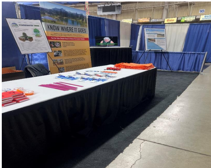
Figure 4. 2023 Central Washington State Fair Booth.

Training materials that target sources of stormwater pollution such as construction site track out and other forms of illicit discharge are always available, in English and Spanish, to our ILA partners and through our stormwater outreach website for dissemination. Brochures and newsletters are also available at the front counter of Public Services Department offices that provide details on BMPs and recent stormwater activities. Brochures are included in Notice of Violation letters to reinforce County BMP policies.