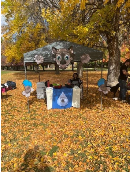
Figure 4. Humane Society Outreach.

Training materials that target sources of stormwater pollution such as construction site track out and other forms of illicit discharge are always available, in English and Spanish, to our ILA partners and through our stormwater outreach website for dissemination. Brochures and newsletters are also available at the front counter of Public Services Department offices that provide details on BMPs and recent stormwater activities. Brochures are included in “Notice of Violation” letters to reinforce County BMP policies.