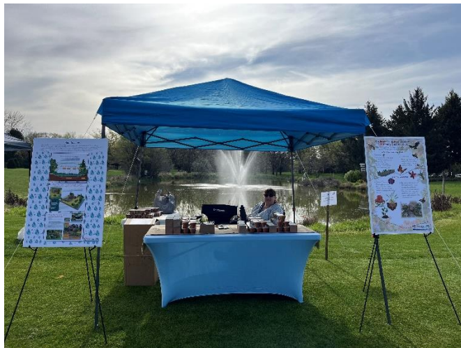
Figure 3. 2024 Arbor Day & Dozer Days Event's

The second event that weekend was the Central Washington Home Builders Association's Dozer Days Event held at State Fair Park in Yakima Washington. Yakima County Public Services Water Resources staff hosted an informational booth at the event that educated the public on the importance of construction stormwater BMP's and stormwater treatment. Selah provided a vacuum truck and street sweeper as a static display and discussed cleaning and maintenance operations with attendees. The City of Union Gap provided a crew of 2 as well as their Street Sweeper on Saturday of the event. Over 2400 people were in attendance.