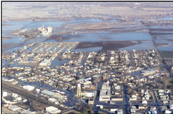
Toppenish Area, Feb. 1996

After the devastating floods of 1996, Yakima County citizens, businesses, and local governments asked for something to be done to decrease current flooding problems and to prevent future problems. On January 13, 1998, the Board of County Commissioners signed the resolution establishing the County-wide Flood Control Zone District.