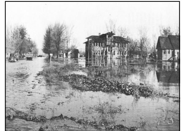
Historic Flood, Toppenish WA, Dec. 1933

The FCZD was created to encourage a more long-term look at flood hazards and determine ways to minimize them.