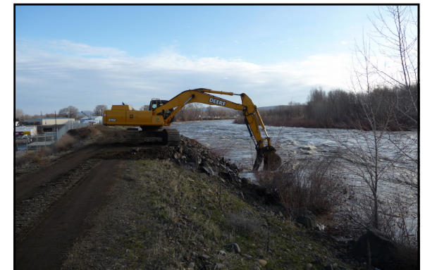
Levee repair Yakima River 2009