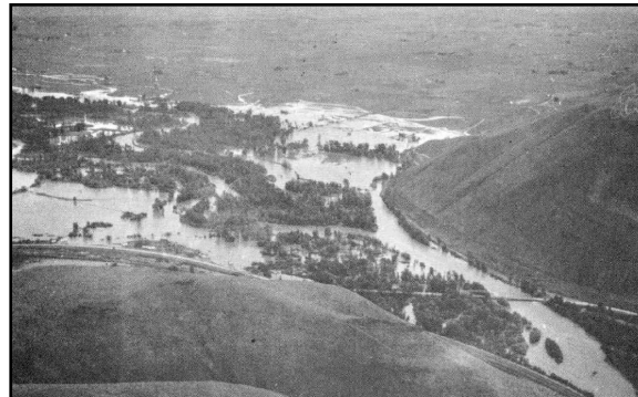
Historic Flood, Union Gap, May 1948

The catastrophic 1933 flood occurred after all of the current dams had been built.